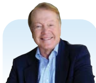
John T. Chambers Co-founder Nile Founder and CEO, JC2 ventures Former CEO and Chairman, Cisco