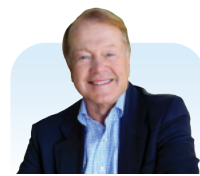
John T. Chambers Co-founder Nile Founder & CEO, JC2 ventures Former CEO & Chairman, Cisco