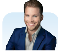
Joe Lonsdale Partner 8VC, Co-founder: Palantir and Addepar